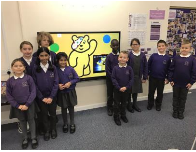
School Parliament CiN Meeting